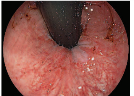
WHITE LIGHT IMAGE