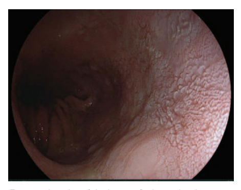
Focus at the edge of the image of a lumen has been improved by minimizing distortion.

CMOS technology provides high resolution images as close as 2mm with less peripheral distortion. This enables closer investigation of surface and micro vascular patterns and may help physicians characterize premalignant lesions.